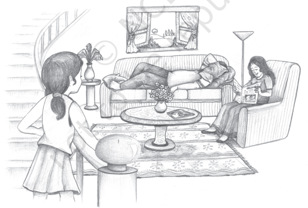
The little girl always found Mother reading and Father stretched out on the sofa.

wretched: unhappy on the brink of suicide: about to commit suicide